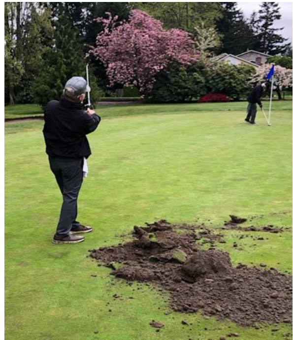
Fill the divots, fix ball marks, and rake sand traps

While playing your normal round of golf, please, take special care to fill as many divots as you have time for on your emphasis hole. If you are assigned a Par 3, please, spend some time sanding the teeing areas.